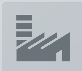
Operator of a business park

Let companies manage their parking space contingents themselves.