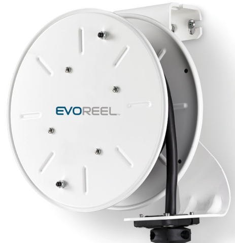
EvoReel® with Charge Cable