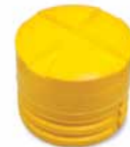
SENSIT FLUSH MOUNT: applied to resist snow ploughs