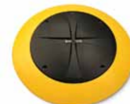
SENSIT SURFACE MOUNT: mainly applied in off-street parking