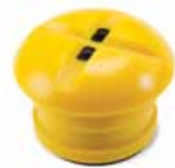
SENSIT STANDARD: mainly applied in on-street parking